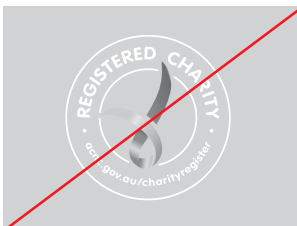
Don't use 'MONO Reverse' logo on a tint of black