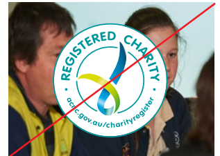
Don't place logo over imagery