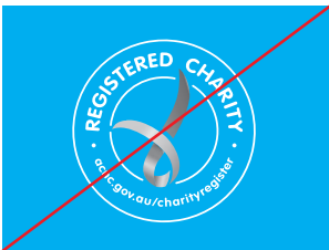
Don't place 'MONO Reverse' logo on a colour background